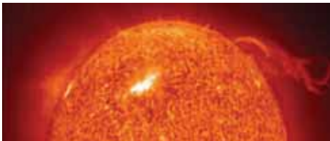
Our sun - The center of our solar sys-

Well folks . . . as they say, “that’s just the tip of the iceberg.” As for the size of our very own, intimate solar system, hang on to your seats because this will blow you away.