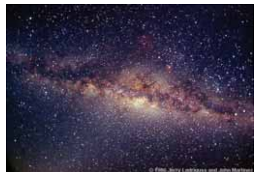
Our Galaxy — The Milky Way

Sometimes, on a clear evening, I will look up and my heart will beat a little faster as I perceive with awe that which we know so little about.