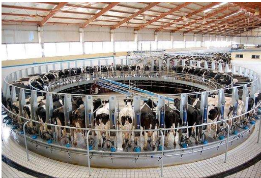
Modern Machine Milking

Natural BST was used as early as 1937 to increase the milk yield in lactating cows. Until the 1980s there was limited use of the compound because the sole source of BST was from bovine cadavers. This posed a health risk, which offset the benefits.