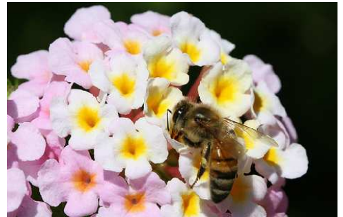
A Working Honeybee

Scientists around the world have been desperately trying to find the cause of what they call "CCD" (colony collapse disorder).